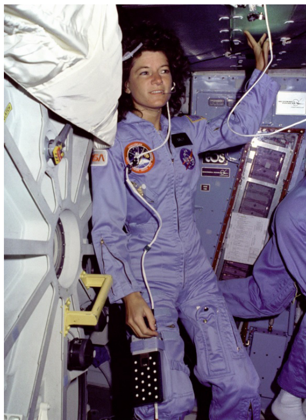
Sally Ride on the Challenger's middeck, 1983.