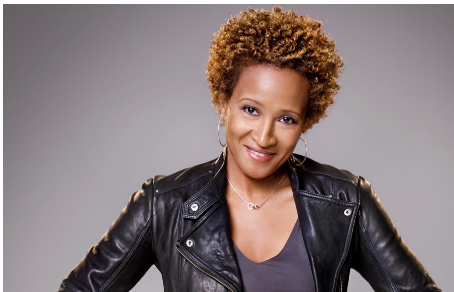
Wanda Sykes, comedian, writer, actor.