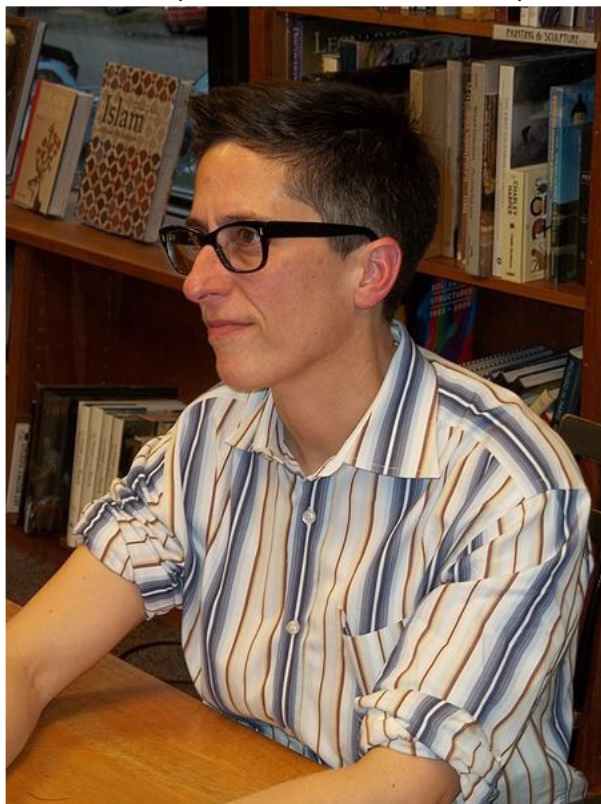
Alison Bechdel at Politics and Prose

Lesbian fashion and expression runs the gamut of individuality. Some lesbians may appear like any conventionally feminine woman, with styled hair, makeup, and feminine clothing. Other lesbians may